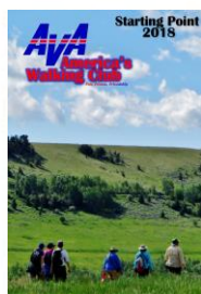
2018 Starting Point $27 + Shipping

Note: If only one to four event or distance books are purchased, shipping is $1.50.