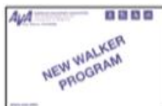
New Walker Packet — $5 (one each of first event and distance books, plus coupons)