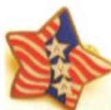
AVA Star — $3