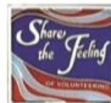
Share the Feeling of Volunteering Pin — $3