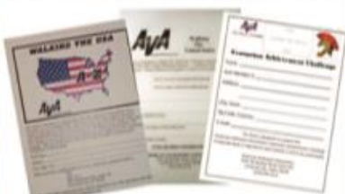
Books, 50 State/51 Capitals — $5 Books, A to Z Walking America — $8 Books, Centurion Achievement Challenge Program — $25 (members only)