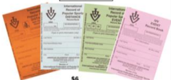
Bike Distance Book brown